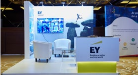
An exclusive "proof of concept" area will be set up outside of the main conference arena.

The area will add a visionary element to the event, allowing technology and innovation leaders of the ICT industry to demonstrate their ideas towards growth, value and the future.